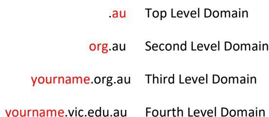
Fig 1: Levels of Domains in .au.